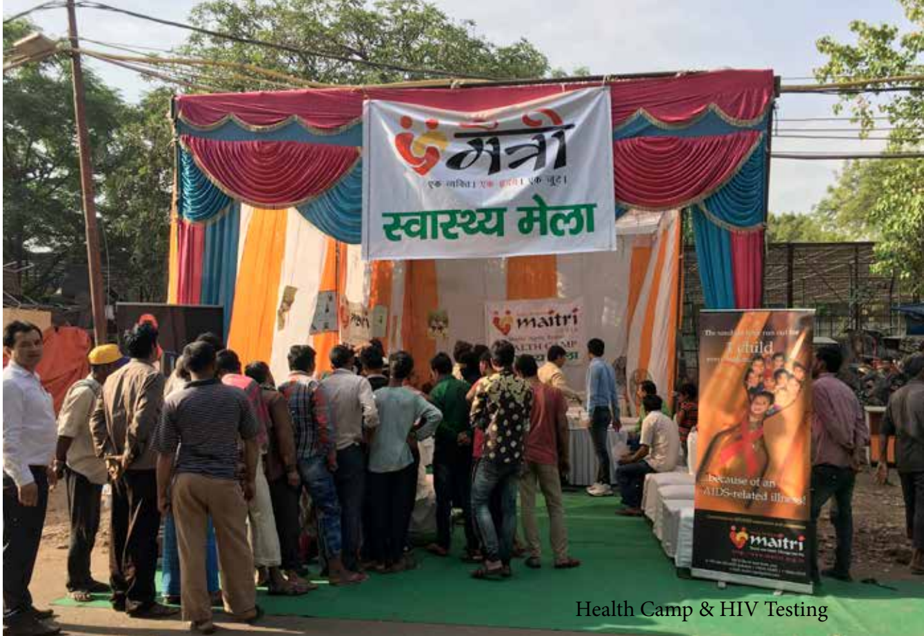
Health Camp & HIV Testing